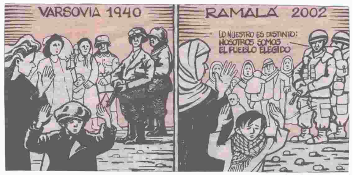
("Ours is different: we are the chosen people")

In May 2002, the Israeli government decided to build a wall or fence of separation, similar to the one that already existed in Gaza, whose efficacy in preventing terrorist attacks Israeli security reports had made clear. The first phase of the building began almost immediately. From the beginning, there was very detailed information on the construction and route of the fence, which penetrated into territories far from the Green Line, as well as about the negative consequences for the everyday life of Palestinians. In Spain, it was the CSCA that focused on this information, from reliable sources both Israeli ( B'tselem ) and Palestinian, most of them grouped in Pengon, the umbrella association of Palestinian NGOs.<sup>43</sup> The symmetry between images of World War II, the concentration camps and the wall/fence was implicitly or explicitly present in many of the popular mobilizations, in which information and protest merged. The Palestinians referred to similar images when they compared their situation to the Warsaw Ghetto, emphasizing the Jewish rebellion.<sup>44</sup>