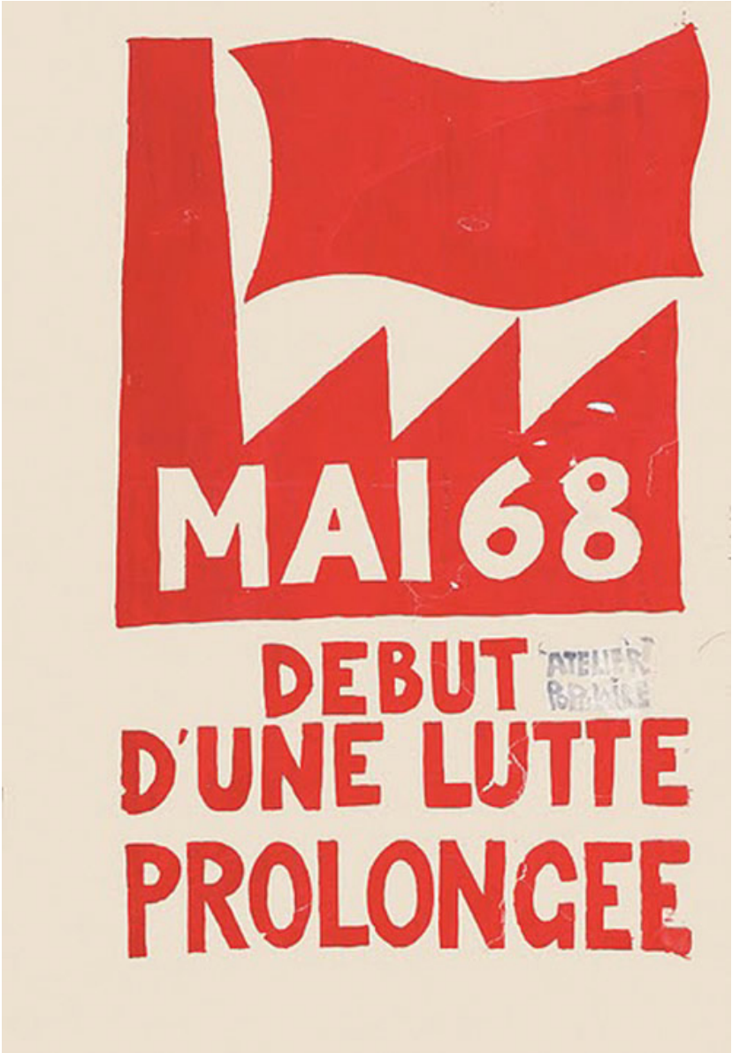
E7. Mai 68. Début d'une lutte prolongée (Mai 68. Beginning of an extended struggle)